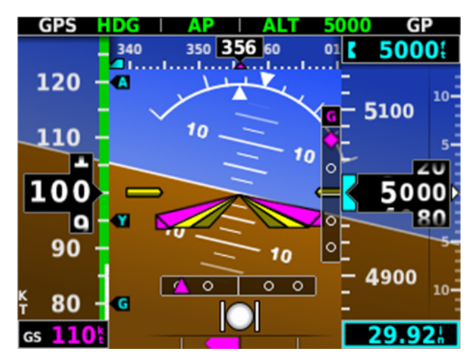
Figure 7-4: G5 Display (Reference Only)