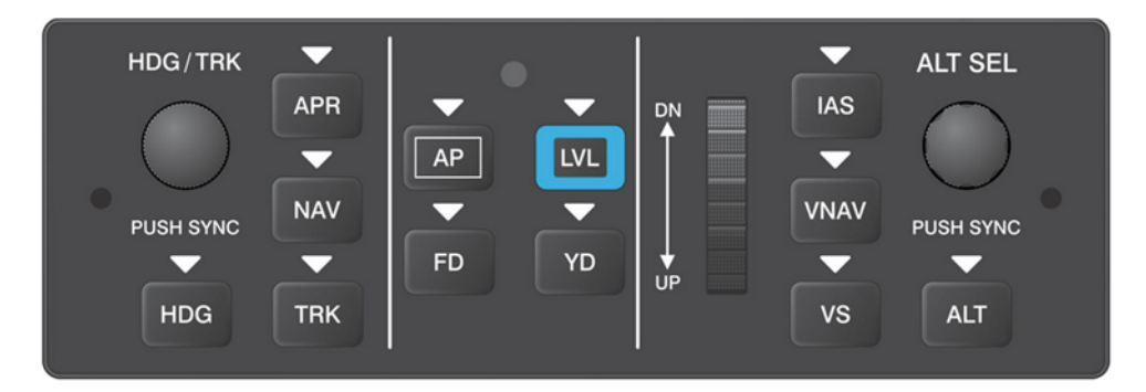
Figure 7-3: GMC 507 Control Unit (Reference Only)